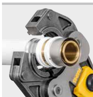
REMS pressing tongs (PZ-S)