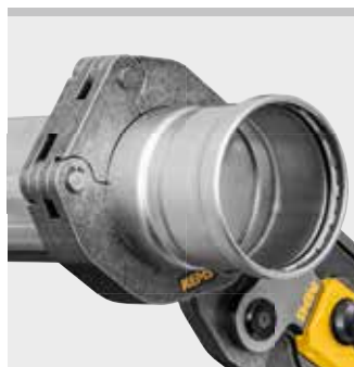
REMS pressing rings (PR-3B)