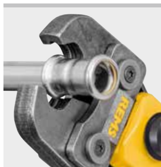
REMS pressing tongs (PZ-2B)