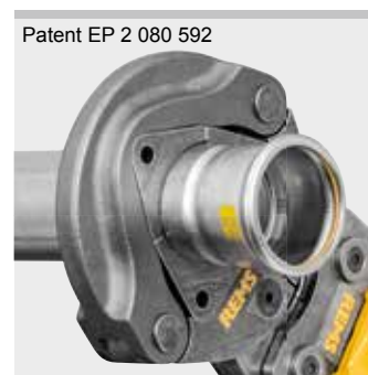
REMS pressing rings (PR-3S)