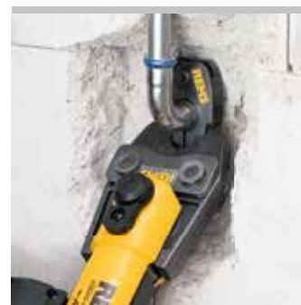
REMS pressing rings 45° (PR-2B) Patent EP 2 774 725