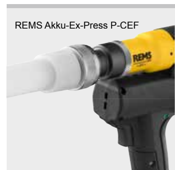
REMS Akku-Ex-Press P-CEF