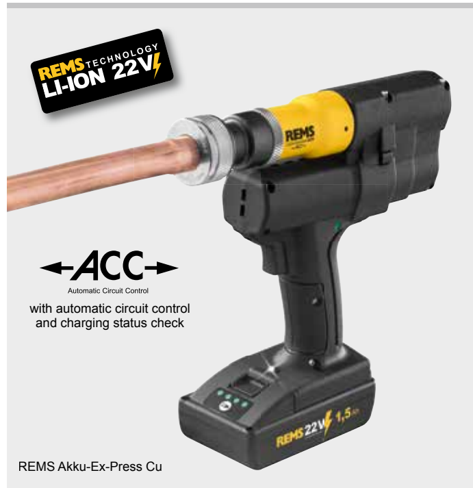
REMS Akku-Ex-Press Cu

High expanding force for perfect, split-second expanding. Thrust force 20 kN. Powerful electro-hydraulic drive with automatic return (ACC), with powerful battery motor 21.6 V, 380 W output, robust planetary gear, eccentric reciprocating pump and compact high power hydraulic system. Safety switch.