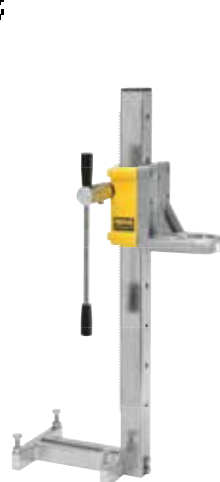
REMS Simplex 2