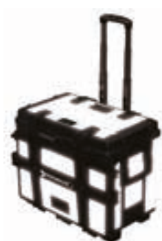
13217 TS RF