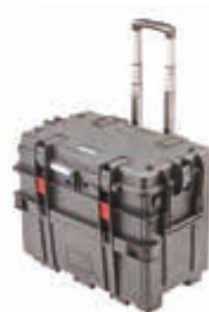
13217 TS IP67